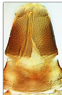
Head & pronotum