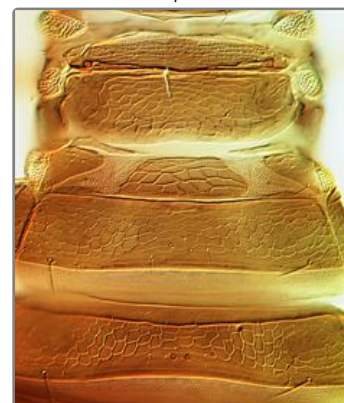
Meso & metanotum, pelta & tergites II-III