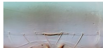
Female sternite VII