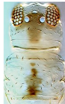
Head & pronotum