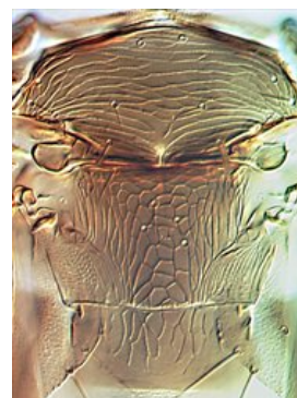
badius meso & metanota