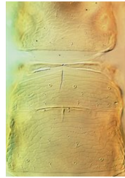
Pro, meso & metanota

zur Strassen R (2003) Die terebranten Thysanopteren Europas und des Mittelmeer-Gebietes. Die Tierwelt Deutschlands 74: 1–271.