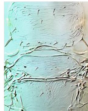
Pro, meso & metanota