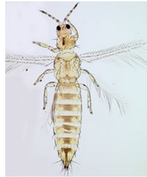
Common pest form

Adults have been taken from a very wide range of plants, feeding and breeding in flowers, on leaves, and often in buds. However, the species has also been reported as a predator on leaf mites under