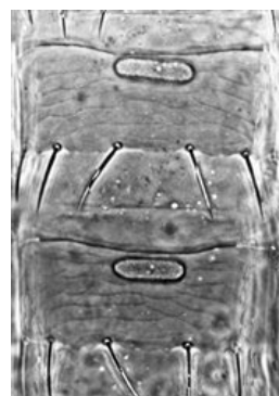
Male sternite pore plates