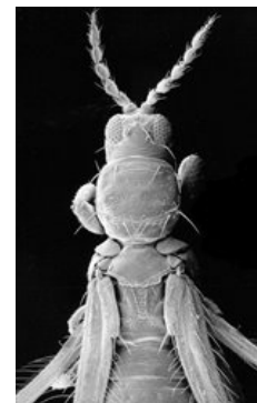
Female - SEM image