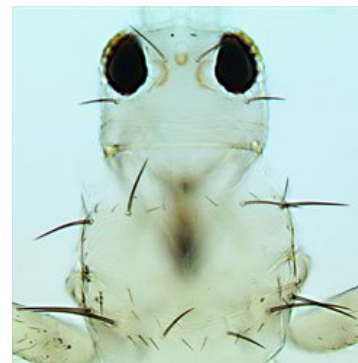
Head & pronotum