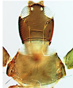
aculeatus Head & pronotum

Previously considered uncommon in Britain, recorded only from the East Anglian Fens plus an historic record from Oxfordshire (Collins, 2006). However, recent findings, including multiple findings across East Anglia and Dumfries & Galloway, suggest that it is both more common in the Fens than thought previously, and more widespread in