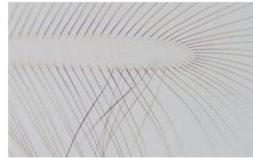
Fore wing duplicated cilia

Okajima S (2006) The Suborder Tubulifera (Thysanoptera). The Insects of Japan 2 : 1–720.