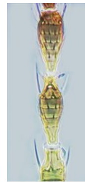
Antennal segments IV-V

zur Strassen R (2003) Die terebranten Thysanopteren Europas und des Mittelmeer-Gebietes. Die Tierwelt Deutschlands 74 : 1–271.