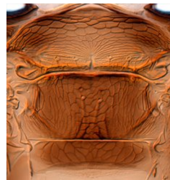
Mesonotum & metanotum