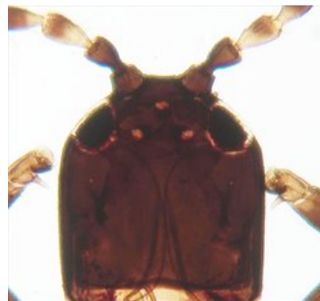
Head & fore tarsi