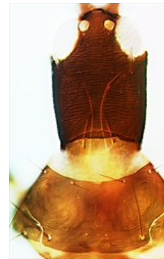
setinodis Head & pronotum