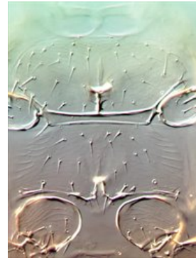
Meso & metathoracic furcae