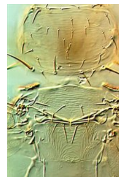
Pro, meso & metanota