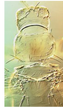
Head & thorax