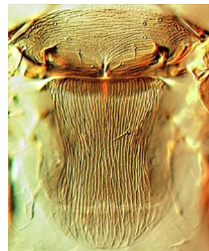
Meso & metanota