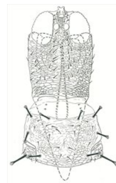
Head & pronotum