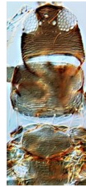
Head & thorax

Both sexes fully winged. Body, legs and antennae brown, except tarsi and antennal segment III yellow, and antennal segment IV brownish-yellow; fore wings shaded with base sharply pale. Antennae 8-segmented, VII–VIII elongate, longer than V+VI, III and IV each with slender forked sense cone. Head with 2 pairs of ocellar setae, pair III arising between posterior ocelli and longer than side of ocellar triangle; maxillary palps 3-segmented. Pronotum transversely reticulate, with 2 pairs of long posteroangular setae, 3 pairs of posteromarginal setae. Mesonotum with anterior pair of campaniform sensilla, median setae arising far anterior to posterior margin. Metanotum reticulate, median setae just behind anterior margin; campaniform sensilla present. Fore wing first vein with 3 setae on distal half, second vein with about 8 setae. Abdominal tergites with transverse reticulation, median pair of setae long but far apart, campaniform sensilla on posterior third of tergite; VIII with a complete marginal comb; IX with 2 pairs of campaniform sensilla, X without a dorsal split. Sternites without discal setae, setae S1 in VII arising in front of margin. Male similar to female; sternites III–VII with large pore plate; tergite IX without stout setae medially.