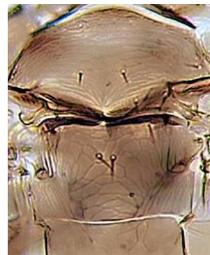
Meso & metanotum