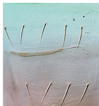
Female stemites VI-VII