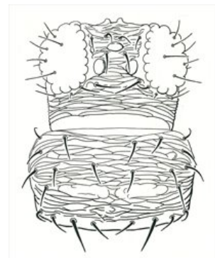
Head & pronotum