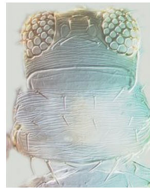
Head & pronotum