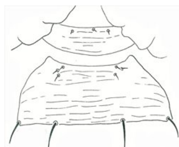
Female sternites II