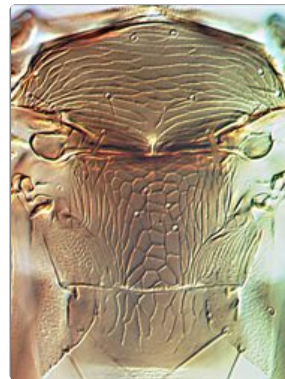
badius meso & metanota