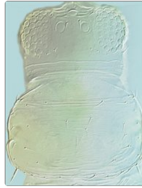
Head & pronotum