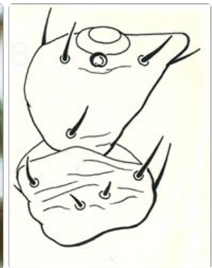
Antennal segments I-II