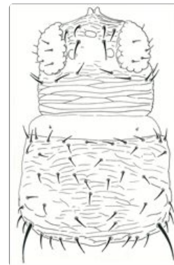
Head & pronotum