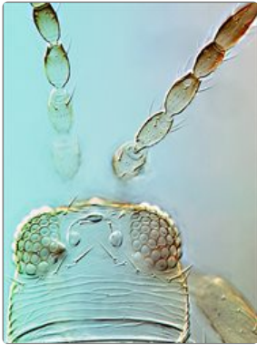
Head & antenna