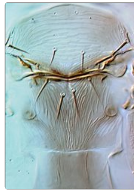
Meso & metanota

Male similar to female but smaller and yellow; tergite VIII with well-developed posteromarginal comb; sternites III–VIII with discal setae, III–VII with pore plate in front of discal setae.