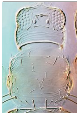
Head & pronotum