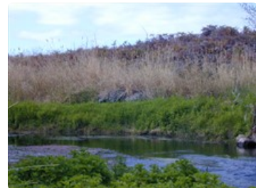
Darlot Creek, type locality of Austropyrgus eumekes .