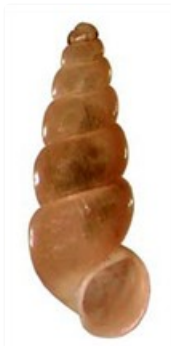
Austropyrgus eumekes (2.7-3.6 mm)