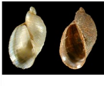
Bayardella cosmeta (adult size 6-8 mm)