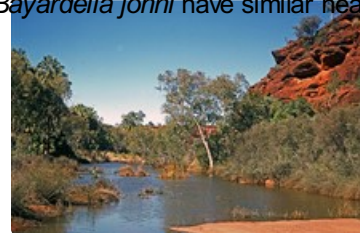
Palm Valley, showing habitat of B. cosmeta.

periostracal spiral ridges. B. cosmeta has a narrower spire and a less distinct shoulder and tends to be smaller than G. aliciae . B. cosmeta is also more spindle-shaped (elongate) compared to B. johni .