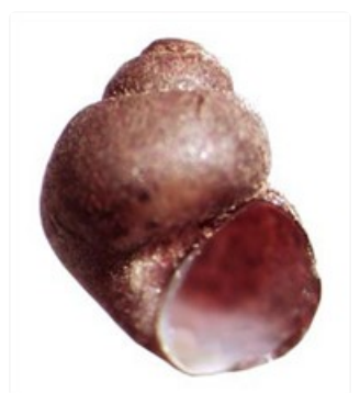
Beddomeia bellii (adult size 2.4-3 mm)