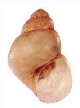
Beddomeia hullii (adult size 2.3-2.8 mm)

Species of the B. hullii group are found in the northern half of