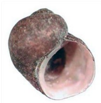
Beddomeia paludinella paludinella (adult size 3.7-5.6 mm)