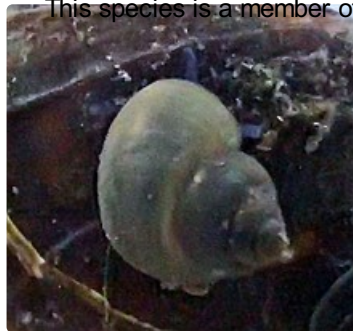
Beddomeia tumida . Living specimen from Great Lake.