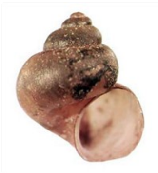
Beddomeia tumida (adult size 3.8-4.2 mm)

This species is a member of the B. launcestonensis group, all of