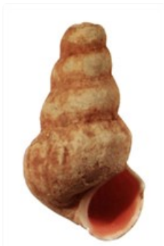
Coxiella glauerti (adult size up to 13.7 mm)

Somewhat similar to C. pyrrhostoma but differs from it in its more