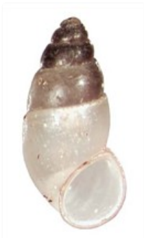
Fluviopupa gracilis gracilis (adult size up to 3.6 mm)