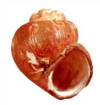
Gabbia adusta (adult size 5-6.8 mm)