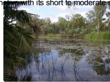
Pool near Esey Cemetery, near Mataranka, Northern Territory. Habitat of Gabbia smithi and G. adusta .

yellowish to reddish or orange brown colour, and weak to moderate, narrow axial ribs with very fine spiral striae. The populations attributed to this species encompass considerable variation in shell size and shape (relative length of spire), and in the degree of umbilication.