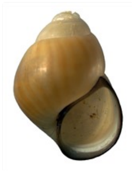
Gabbia beecheyi (adult size 7-9.9 mm)

This species is similar to G. kessneri . However, G. beecheyi is usually