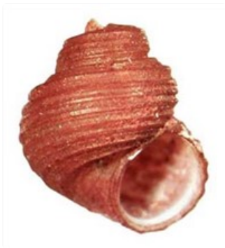
Gabbia carinata (adult size 2.6-4.3 mm)

This species is very distinctive amongst the Australian fauna with its