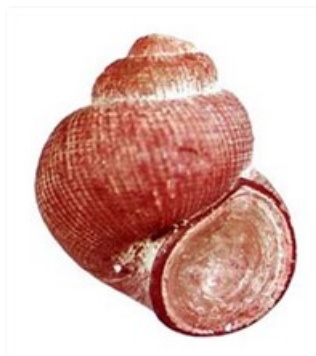
Gabbia clathrata (adult size 4.1-6.5 mm)

This species is very distinctive and unique in its solid, broadly-ovate,