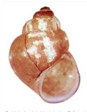
Gabbia iredalei (adult size 7-9 mm)

This species differs from G. vertiginosa in having a more inflated shell