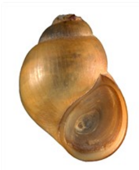
Gabbia kessneri (adult size 8-11.1 mm)

Differs from all other Australian species, other than G. beecheyi , in its