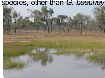
Pool near Adelaide River, Northern Territory - typical habitat of Gabbia kessneri .