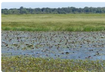
Harrison Dam NT., a locality where G. kessneri is found.

large, greenish, smooth, shining, ovate shell with convex spire. Gabbia kessneri however differs from G. beecheyi , in its somewhat larger size, and an aperture that is more rounded anteriorly.