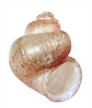
Gabbia lutaria (adult size 2-2.8 mm)