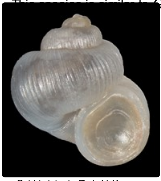
Gabbia lutraria.