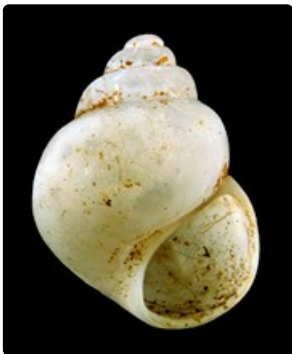
Gabbia napierensis (adult size 4-5.1 mm)

Gabbia napierensis has a narrow thickened callus behind the inner lip