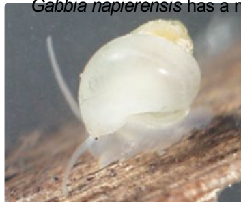
Gabbia napierensis, living animal.