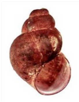
Gabbia vertiginosa (adult size 5-7.4 mm)

This rather variable species has a smooth ovate-conic to conic shell,