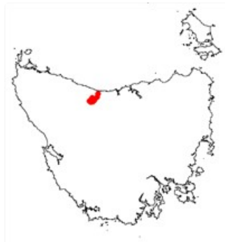
Distribution of Glacidorbis bicarinatus .