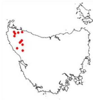
Distribution of Glacidorbis decoratus .