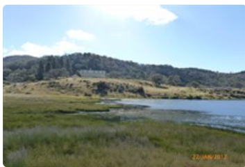
Diggers Creek, Kosciusko National Park.

sculptured with weak growth lines only. It reaches 2.9 mm in maximum diameter, but is usually around 2 mm.