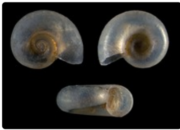
Glacidorbis hedleyi (adult size 1.8-2.9 mm)

This species has rounded whorls (rarely dorsally subangled), and is