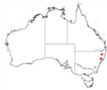
Distribution of Glacidorbis isolatus .