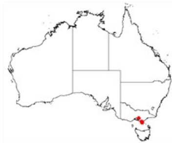
Distribution of Glacidorbis rusticus .