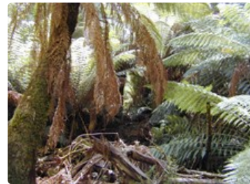
Sherbroke Creek, Dandenong Ranges, a locality in which Glacidorbis rusticus occurs.