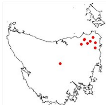
Distribution of Glacidorbis tasmanicus .