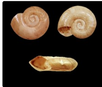
Gyraulus (Gyraulus) waterhousei (adult size up to 4.3 mm)