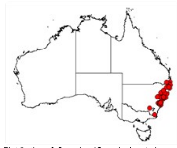
Distribution of Gyraulus (Gyraulus) waterhousei .