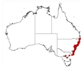
Distribution of Hyridella australis .