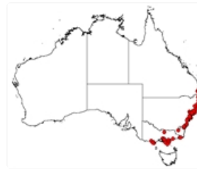
Distribution of Hyridella drapeta .