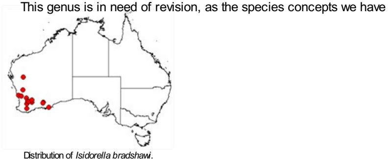
Isidorella bradshawi (adult size up to 20 mm)

used have not been rigorously tested. Unpublished molecular data indicate that the species units we are here using appear to be justified, however they are not accompanied by clear-cut morphological characters that allow separation based on shell characters alone. As the species units appear to be overall concordant with state boundaries, we have used these boundaries to delimit species. This situation is not ideal and can only be resolved by additional molecular and morphological studies involving dense sampling.